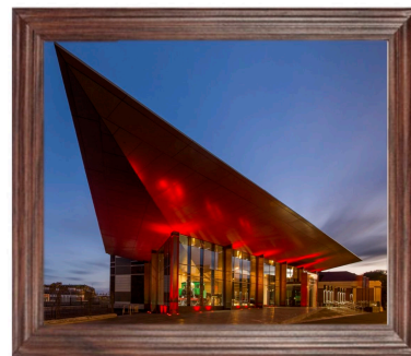
Toitu - Settlers Museum Free Admission