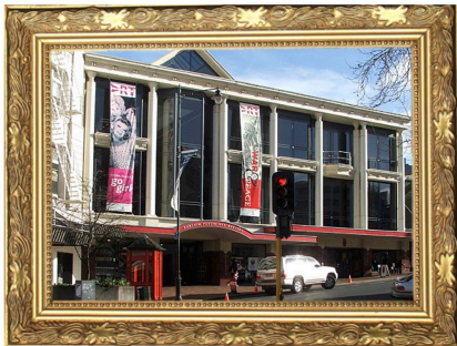
Dunedin Art Gallery Free Admission