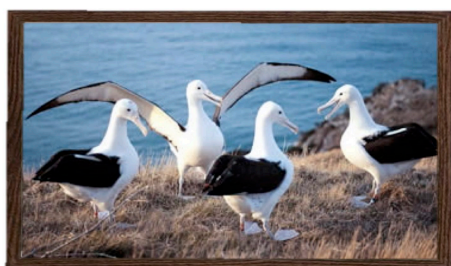
Royal Albatross Colony Free Admission