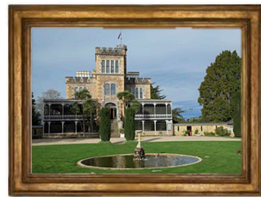
Larnachs Castle Admission charges

Before or after the show, Why don't you visit some of Dunedin's unique attractions.