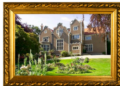
Ovelston - 19th Century Historic House as lived in Admission charges