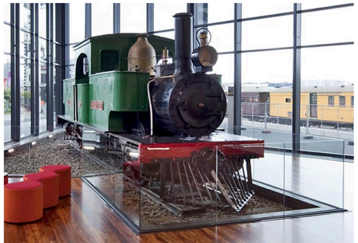
'Josephine' retired, restored and on display

'Josephine', the Train, is the prominent feature in the Josephine Foyer. She was one of two Double Fairlie locomotives brought from England in 1872 and began her career on the Dunedin-Port Chalmers railway line. Her sister train was 'Rose'.