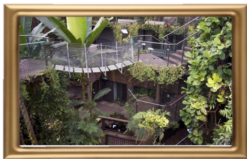
Butterfly World at Otago Museum Admission charges