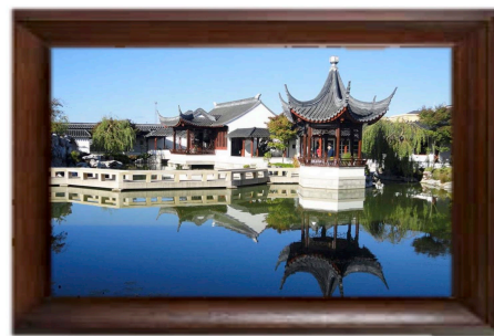
Chinese Garden Admission charges